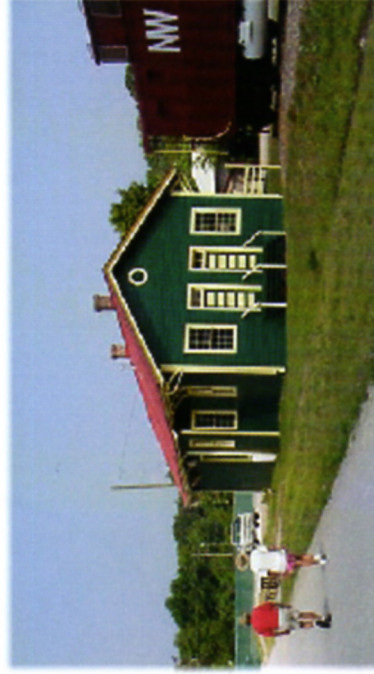
The Ringgold Depot, Ringgold, Virginia Oldest in the U.S. on Original Underpinnings