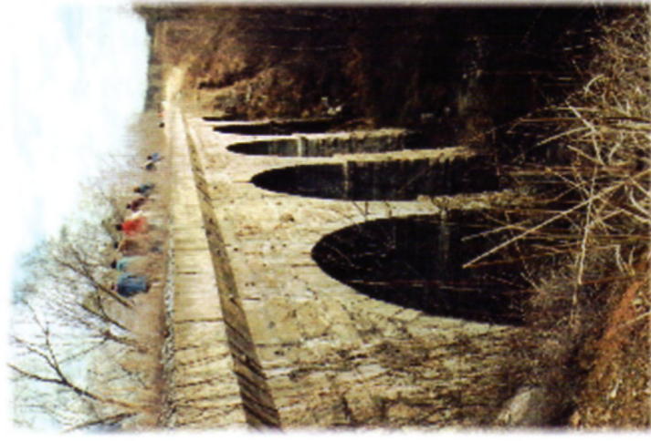
Five - Arch Stone Trestle over Sandy Creek Circa 1850