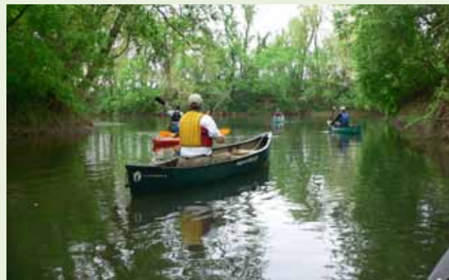
Boating on the lower Dan River.

Their comments and details regarding the scope, funding and status of the studies can be found at www.danriver.org . Click on the link on the home page under “DRBA News.”