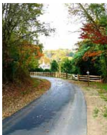
Fall colors on the D&W.