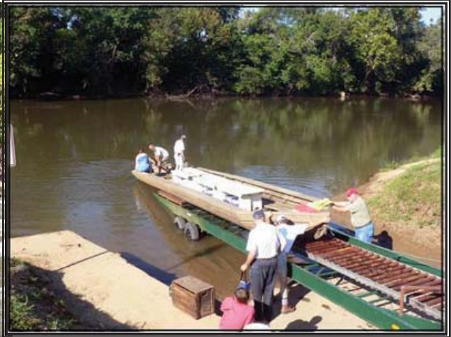
Clockwise from top left : Shooting Dix's Shoal Sluice; Launching the bateau at Angler's Pride Park , Danville, VA; Leaving Dix's Shoal Island after lunch; On the river; DRBA, Naturalist Club, Rockingham County Historical Society Booths at Eden Riverfest; 3 Rivers Outfitters' canoes for rent at Riverfest; View of a bateau excursion from the new Leaksville Landing Bridge.