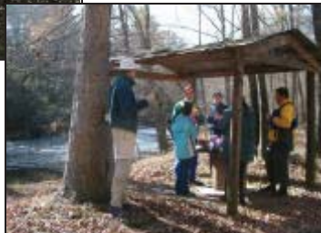
Above: Lunch time at American Legion Hut on Joel Johnson Road.