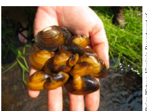
The endangered James spinymussel

North Carolina Wildlife Resources Commission