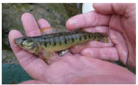
The endangered Roanoke logperch

The river also provides a vital habitat area for fish and wildlife, including the endangered Roanoke logperch ( Percina rex ) and the James spinymussel ( Pleurobema collina ). Another freshwater mussel species, the green floater ( Lasmigona subviridis ), can also be found in the river and is under