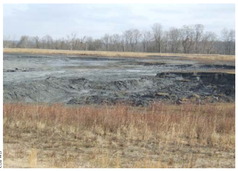
The breached impoundment that released coal ash and coal ash wastewater.

review by the Service to determine if the species warrants protection under the federal Endangered Species Act.