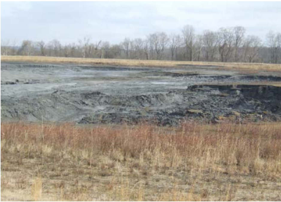
The breached impoundment that released coal ash and coal ash wastewater.

review by the Service to determine if the species warrants protection under the federal Endangered Species Act.