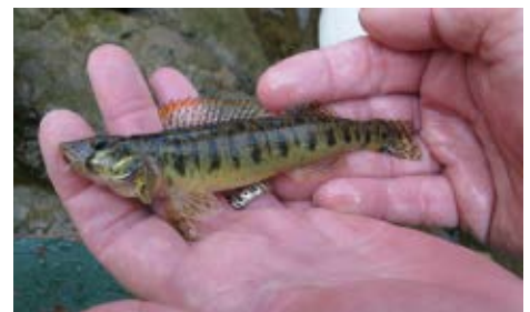
The endangered Roanoke logperch

The river also provides a vital habitat area for fish and wildlife, including the endangered Roanoke logperch ( Percina rex ) and the James spinymussel ( Pleurobema collina ). Another freshwater mussel species, the green floater ( Lasmigona subviridis ), can also be found in the river and is under