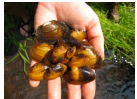
The endangered James spinymussel

North Carolina Wildlife Resources Commission