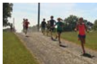
A youth run started the day off with a thrill!

Beautiful weather, friends young and old and the thrill of competition... where else should you be? It was the Annual Run with the Cows at the Chinqua-Penn Trail in Reidsville, NC. Nearly 100 participants enjoyed the day and crossed the finish line with a smile!