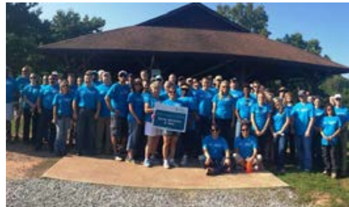
Duke Energy Team of Volunteers