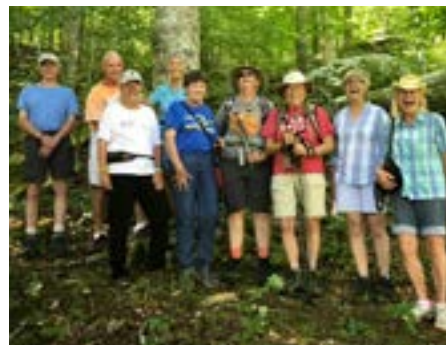
Trail Trekkers enjoy a day amongst friends and nature

This group, co-sponsored by Henry County Parks & Recreation and the Dan River Basin Association, meet on Thursdays to explore a different trail every week. Weather permitting, we meet at designated locations throughout the county or nearby parts of neighboring counties. All the trails selected are moderate in length and difficulty, and senior-friendly, but there is no minimum age requirement.