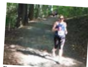
Both sun and shade provided a welcomed respite along the trail