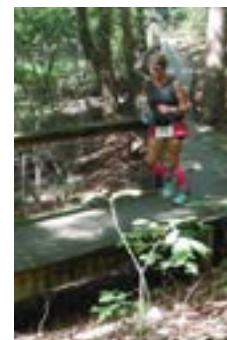
Runners enjoyed a variety of terrains -- from natural trail to boardwalk