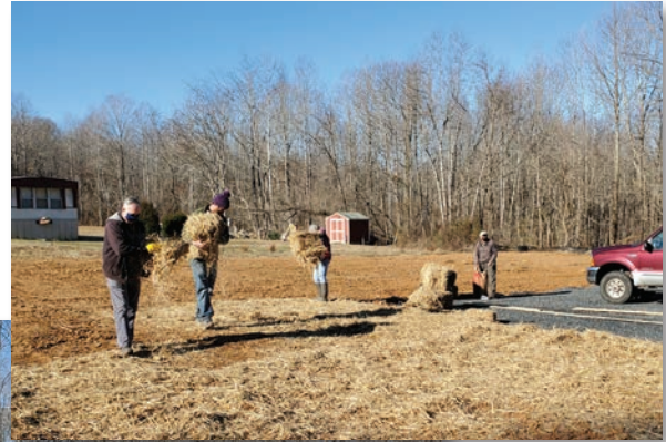
DRBA volunteers provided the finishing touch to the parking area at Rockingham County's newest park.