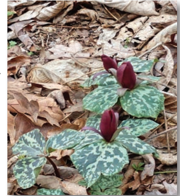
Sweet Betsy Trillium

As you walk the 1.6-mile loop, you will hear from the pastures the songs of Meadowlarks and Bluebirds, garbed in their brightest plumage, followed by a chorus of Spring Peepers and Bullfrogs in Betsy Pond and the nearby streams. Just across the trail from Little Niagara waterfall, tiny Spring Ephemeral wildflowers are pushing up through the blanket of last year's leaves to announce the arrival of warmer days. Trout Lilies, Bloodroot, Bluets, and Trilliums await careful observers.