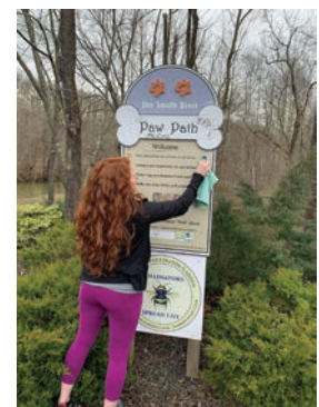
Stephanie Brooks Bates cleans graffiti from the new Paw Path sign near where the new Paw Park will be located

Be sure to sign up for the Volunteer alert on our website or the E-newsletter to learn about the upcoming work days.