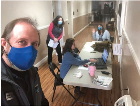
DRBA Staff Members worked to coordinate the first virtual annual meeting