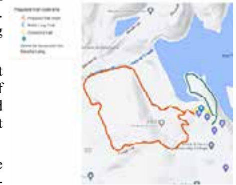
PHCC Beaver Creek Trail

Look for the new trail to be completed in 2023.