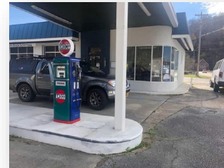
Smith River Outfitters 3377 Fairystone Park Hwy Bassett, VA 24055