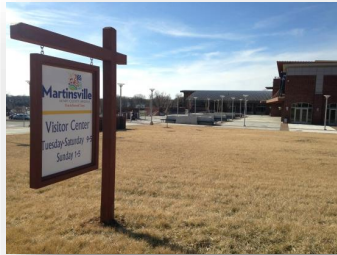
Martinsville Visitor Center 191 Fayette St. Martinsville, VA 24112