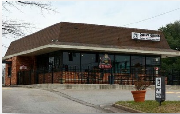
Daily Grind 303 E. Church St. Martinsville, VA 24112