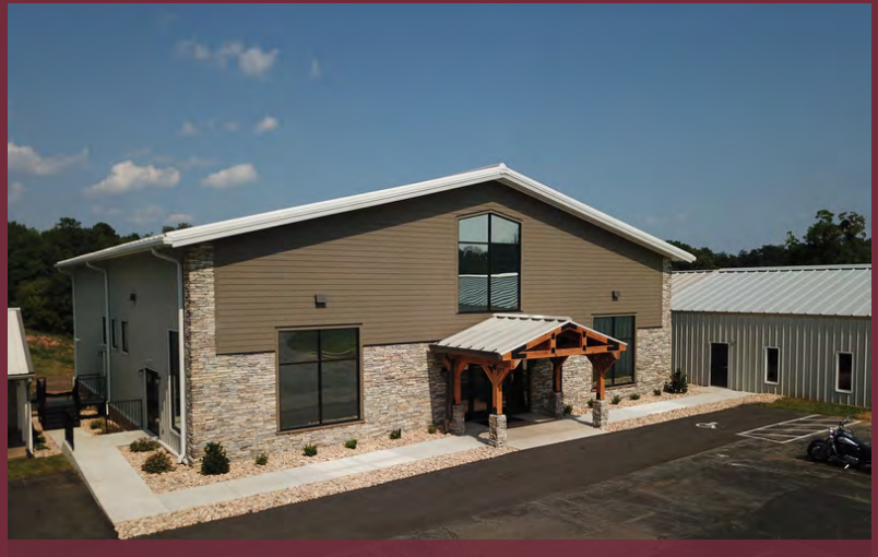
FIRST SOUTHERN BAPTIST | HURT, VA